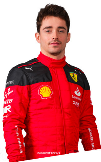
Carlos Sainz #55

It's good points and we have gained ground over Mercedes and McLaren, on a difficult weekend for the team. We obviously want more and we will keep pushing. Now I'm looking forward to our home race at Monza next weekend.